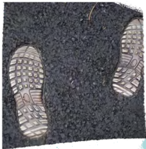
Bronze Foot prints, Elaine Griffin, part of the 'Landmarks' series

The space could suit a permanent sculptural work, commemorating the heritage of the area, or sculptural seating, planters, tree guards; or features in the walk ways and pavements to create routes.