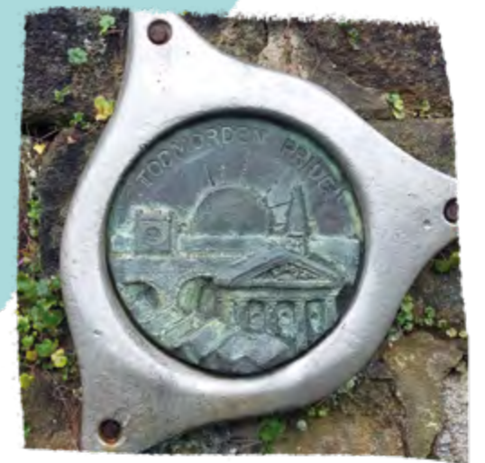
Route Markers, Todmorden Canal Path