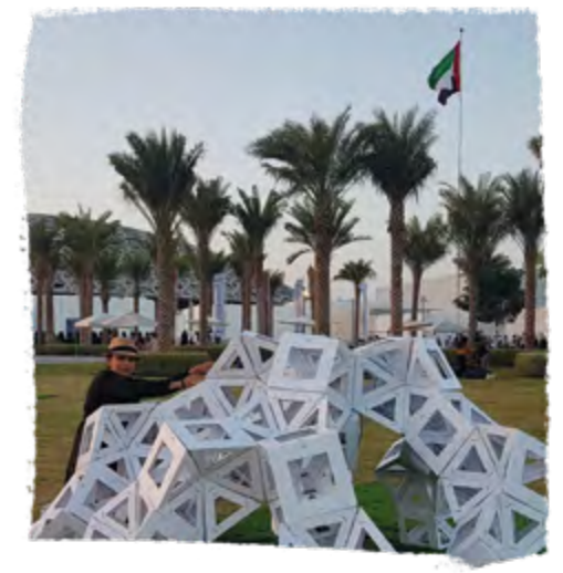
Installation (2018) Folded Cardboard Polyhedra – Saba Rifat