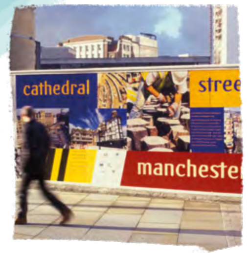
Temporary Hoardings showing work underway and history of the site; Artist & Photo Len Grant