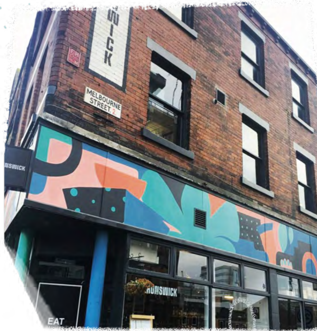
Painted Street Frontages

Commissioning special street signs within the area would serve to reinforce this identity or special events and weekends, handmade bunting could be commissioned to be strung around this area.