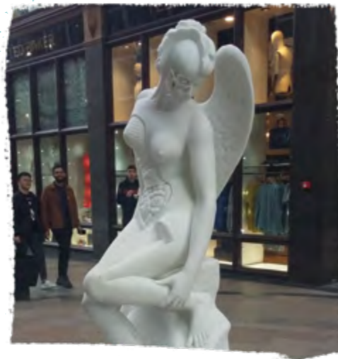
Damien Hirst, 'Hymn', Leeds, Yorkshire Sculpture International

As the artworks are not intended to last, physical works can be vulnerable to damage, intentional and unintentional. There needs to be excellent community engagement to ensure the value and process of the work is understood. Sometimes temporary works are loved so much there can be a demand on the council to make the work permanent, an example being the Gormley installation Another Place at Crosby Beach.