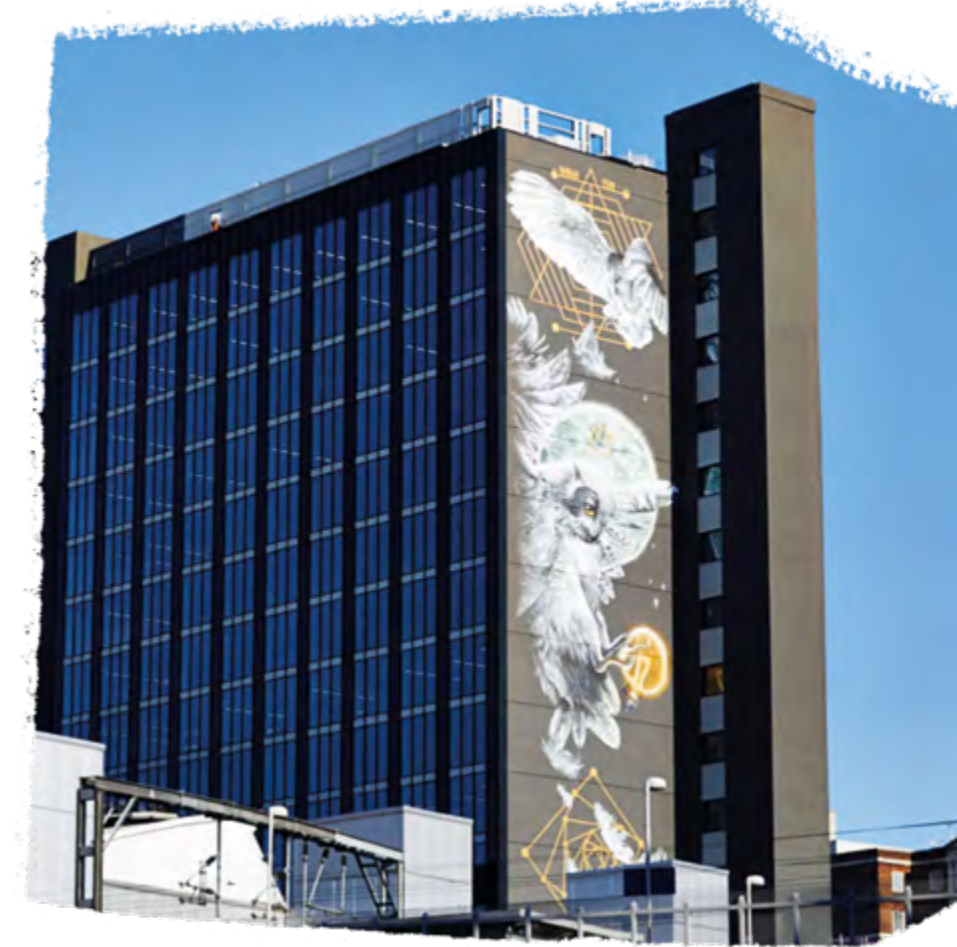
'Athena Rising', Nomad Clan, Leeds