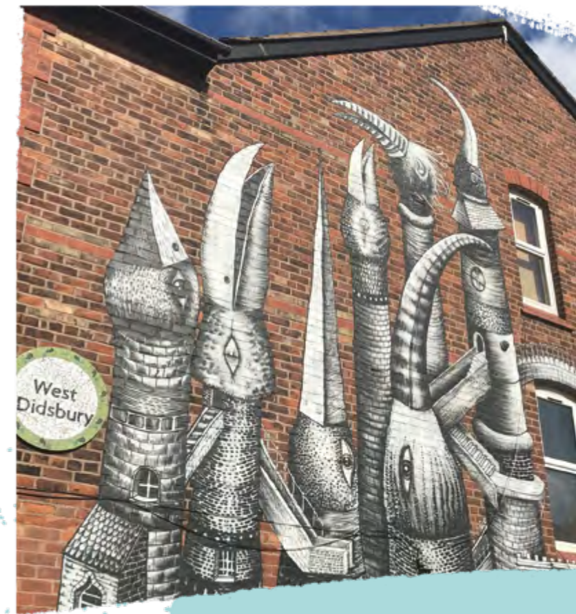
'The Bird Towers', Phlegm, West Didsbury

Even if intended to be temporary, it can cost a lot to prepare surfaces, design and fabricate and install securely. It is important to have an idea of the future plan for the building so a realistic life span can be estimated for the work before preparing the brief.