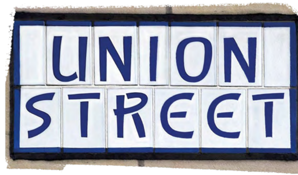
Tiled Street Sign, Northern Quarter, Manchester

There are regulations around much public signage in the public realm, so consideration needs to be given to this as well as to ensure signage is legible and fulfils its principle purpose.