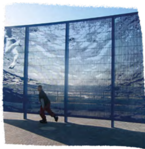
Water Wings, Bruce Williams, Blackpool Promenade