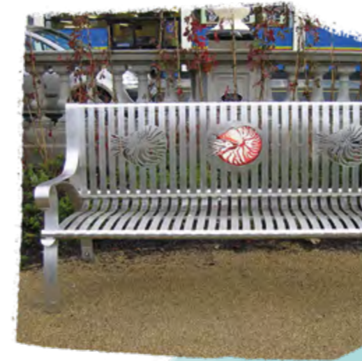
Nautilus Seat, Southport Artist: Kate Maddison, Chrysalis Arts

Market Place a large expanse with a pergola, existing planters and street furniture. Like the Town Hall Square, it is used as a main space for events and the site links to the town hall square across the roadway. As an events space, there is a need to retain flexibility, and for any artworks here to create an environment with good sight lines.