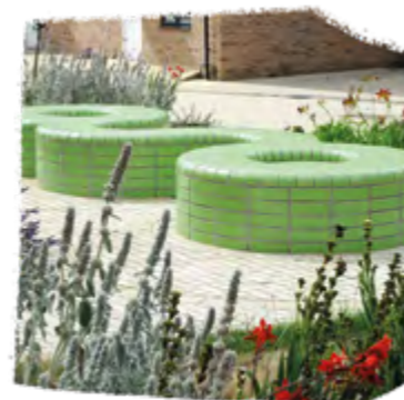
'Seed' Lubna Chowdhary – Glazed brick benches, Orchard Park Estate, Photo: the artist