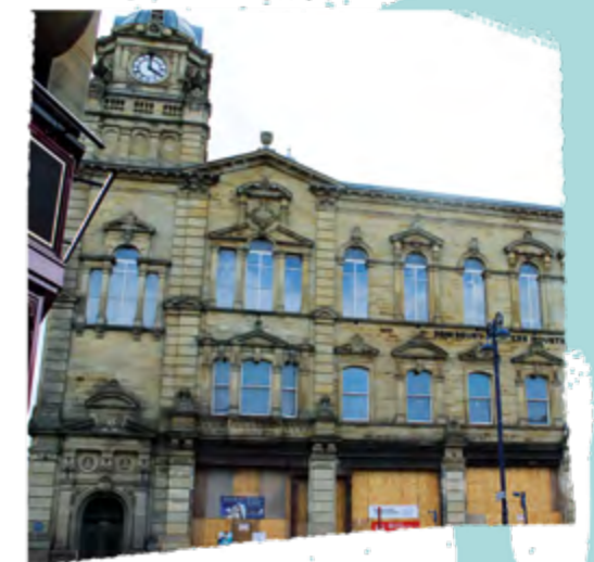
Illuminos: Projection Mapping, Bournemouth