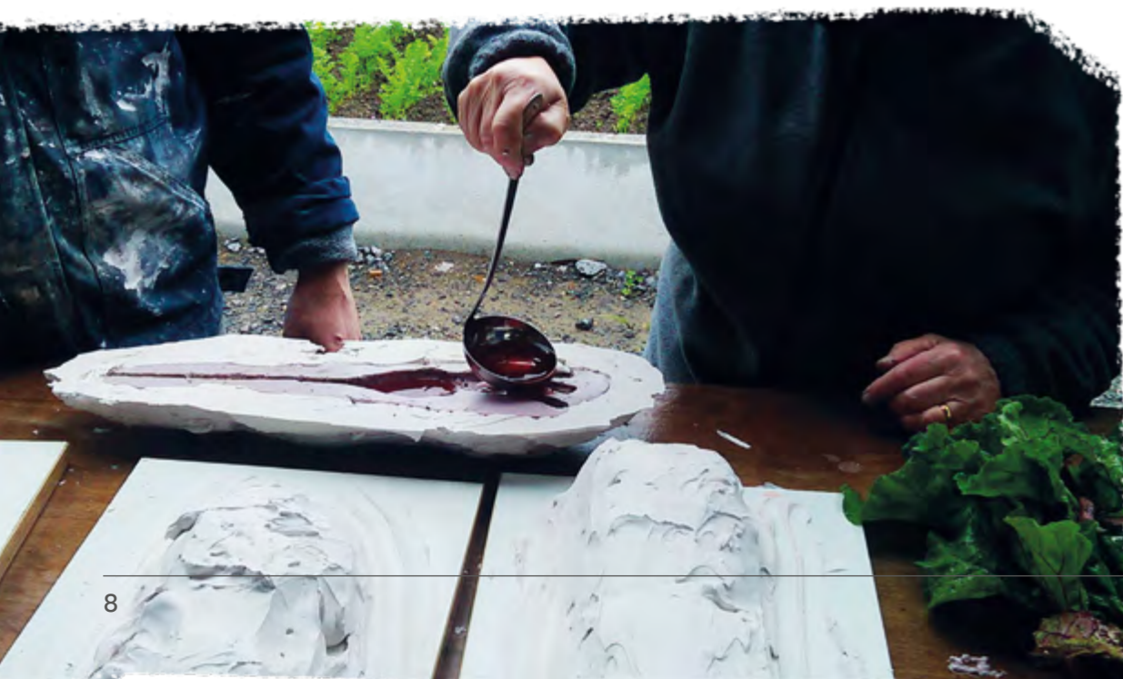
Community members getting involved in making wax moulds for casting

If a budget has been identified for a public art project this can also be used a lever to attract additional funds. This could be by applying to the Arts Council for a complimentary training programme or community engagement programme.