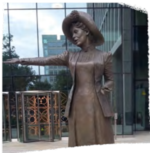
Emmeline Pankhurst, Manchester, artist Hazel Reeves

Permanent works are expensive and there are cost implications for installation to consider. Ongoing maintenance and long-term maintenance and insurance is a big consideration. It is hard to select permanent work that everyone will like – they can often divide opinion sharply. Consultation processes within the selection and the artistic process therefore are very important. Good communication about the nature of the work, transparency about judging criteria and how work has been selected and how the work is funded are crucial.