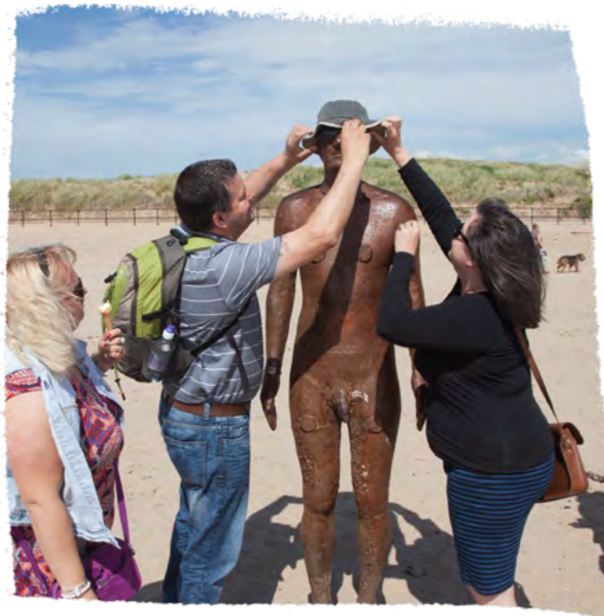
Anthony Gormley, 'Another Place'

These projects can be very time consuming and plans can change so contracts need to be very clear about what is expected of the artist and some flexibility drawn in for both sides. Often different specialists working on partnership projects don't always agree or have the same priorities so it is important the project manager is able to facilitate these discussions and appreciate the viewpoint of the artist.