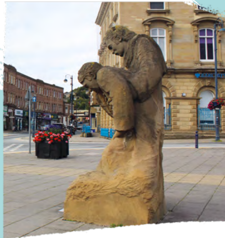
'The Good Samaritan' by Ian Judd