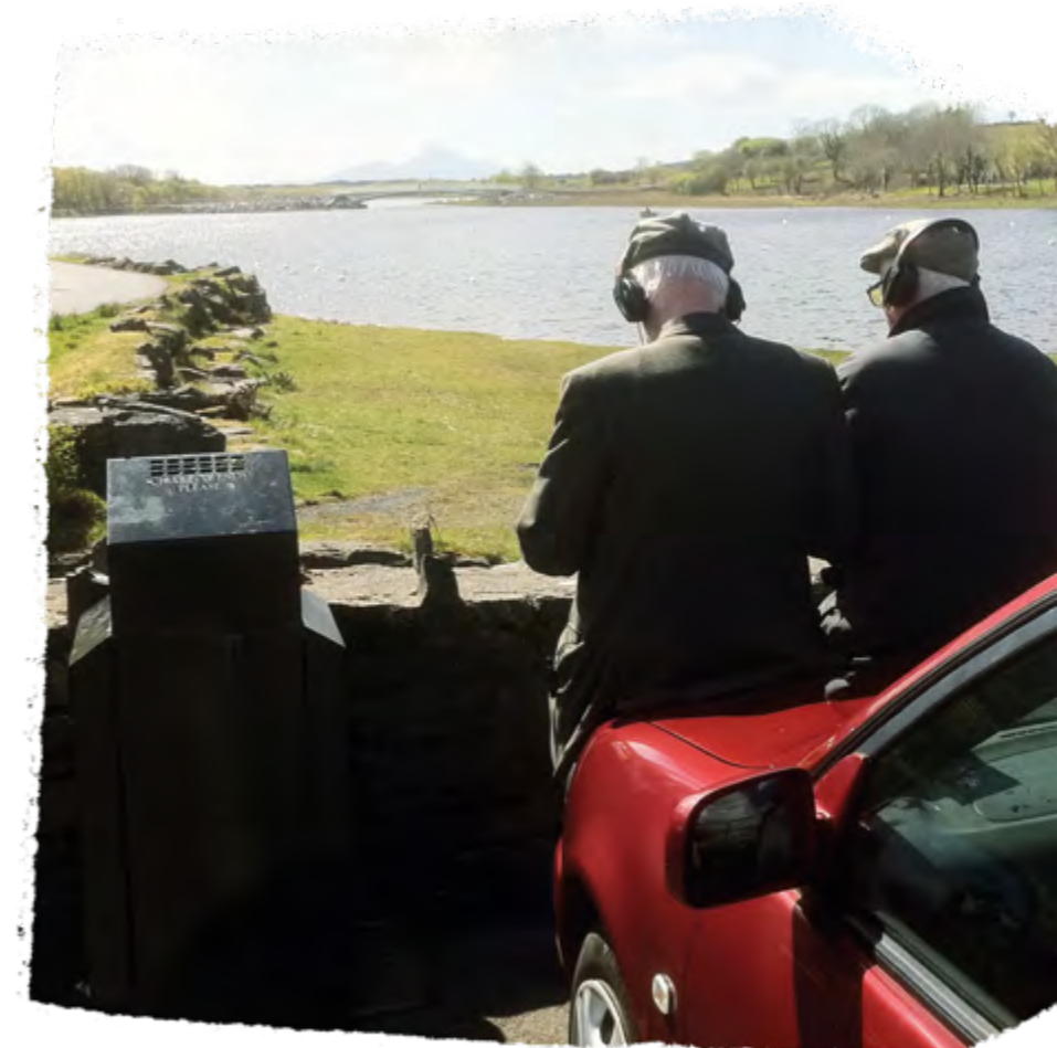
The Performance Corporation 'Across the Lough' – a performance on a boat listened to via an iPod from the water's edge

Think about documentation and how the work can be experienced by people not able to attend, for example live streaming, filming or recording the work. It is important to ensure the safety of performers as well as audience members so risk assessments and enough support staff need to be in place.